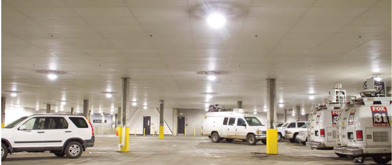
Dialight DuroSite® LED Low Bays improve lighting at FOX31 while reducing maintenance and operating cost

“The improved visibility is quite dramatic, like night and day almost,” Stern said. “Since the optics in the Dialight units are optimized for low-bay applications, they efficiently direct the light exactly where it’s needed and better illuminate the area while minimizing glare, which makes for a safer environment for drivers in the facility.”